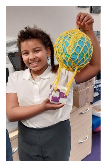
Weeks of hard work at art club!